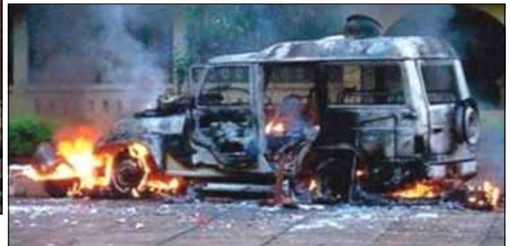
Vehicle of Christian missionaries put in flame by the rioters.