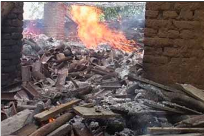
Destruction of an orphanage in flame by the persecutors in Orissa. People are burnt alive.