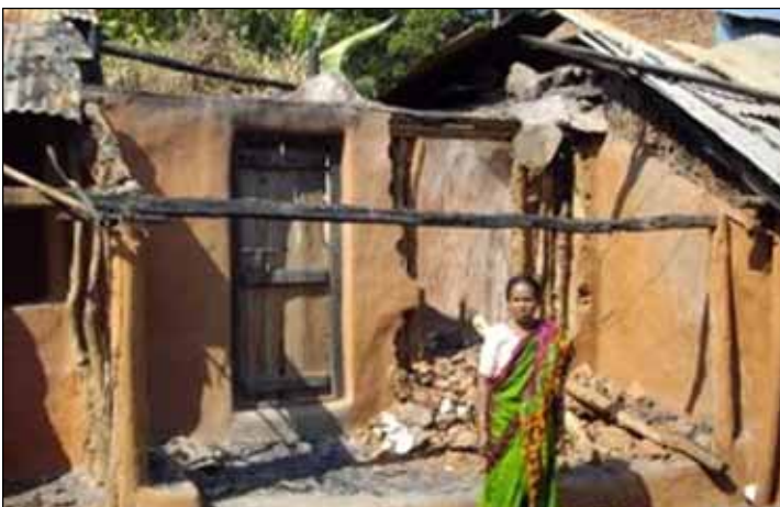
House of poor Christians are destroyed because of their unwillingness to go back to Hinduism.

The latest reality is that the relief camps are slowly closing down. People are forced to go back to their own villages. But the fear of being killed by Hindus is very much among the Christians. Hindus demand the Christians to revert to Hinduism. If not they will be killed. It is a pathetic condition that many Christians are reconverted to Hinduism for the sake of life. So now the new policy is from violence to conversion. In this situation can we blame